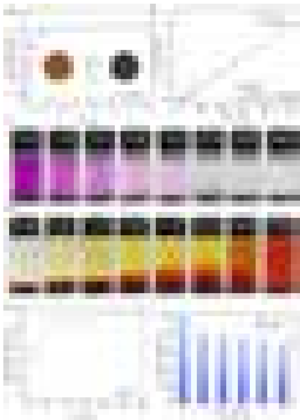
Figure 3. (a) I 2 adsorption curve of LNU-13 at 348 K. Inset: the photographs reveal the color change in LNU-13 before and after iodine adsorption; (b) curve-fitting for the I 2 adsorption process; (c) photographs showing the iodine-adsorbed process in n-hexane; (d) photographs showing the iodine-released process of LNU-13@I 2 in ethanol; (e) I 2 release curve of LNU-13@I 2 at 398 K; (f) recycling experiment of LNU-13.