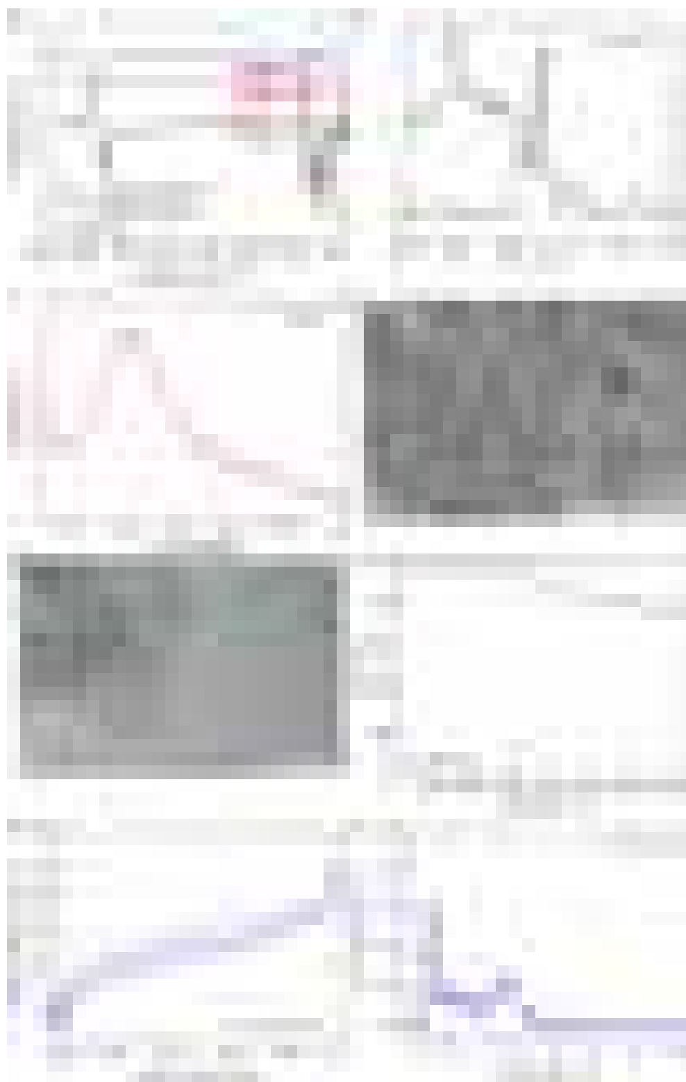
Figure 2. (a) FTIR spectra of 2,7-dibromocarbazole, 1,3,5-triethynylbenzene, and LNU-13; (b) solid-state 13 C NMR spectrum of LNU-13; (c) powder X-ray diffraction pattern of LNU-13. (d) SEM image of LNU-13; (e) TEM image of LNU-13; (f) TGA plot of LNU-13 at N 2 condition with a ramp rate of 5 °C min -1 ; (g) N 2 adsorption-desorption isotherm of LNU-13; (h) pore size distribution of LNU-13.